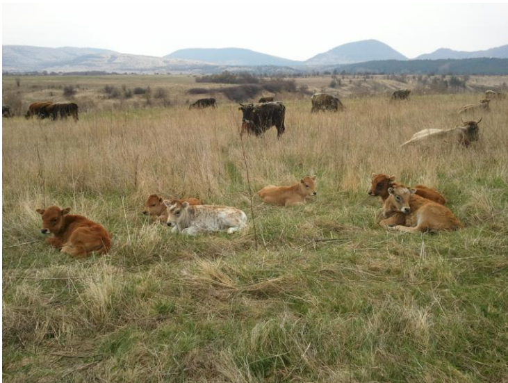
Rest area: Busha calves