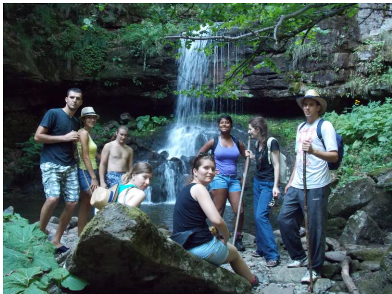
The attendants of the 2013 Summer School - free time at the Senokos river waterfall