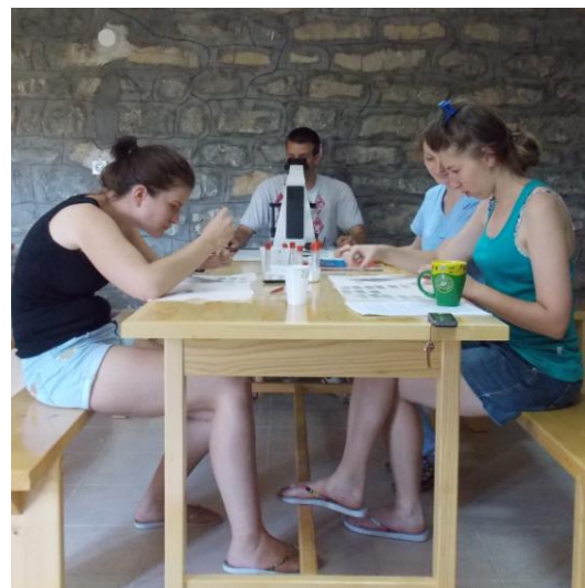
Summer School for Mountain Animal Breeding 2013 - practical training on „Mojinci“ farm (above) and Dojkinci river waterfall (below left)