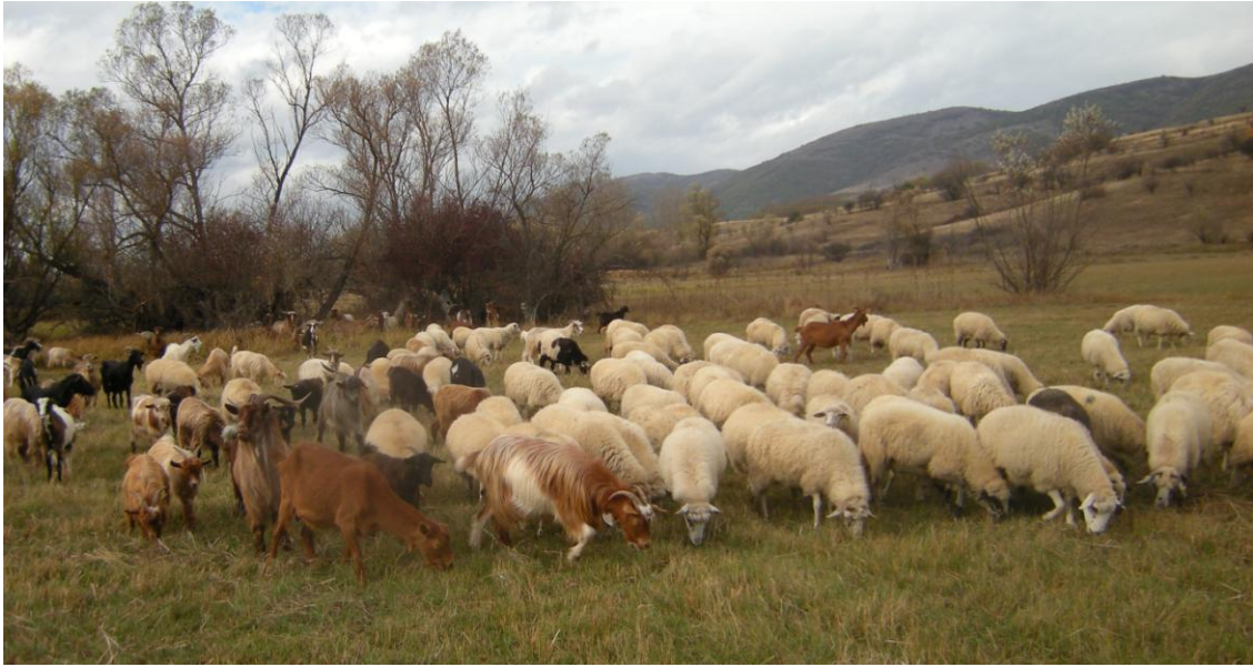
Zackel (Pramenka) sheep and goats